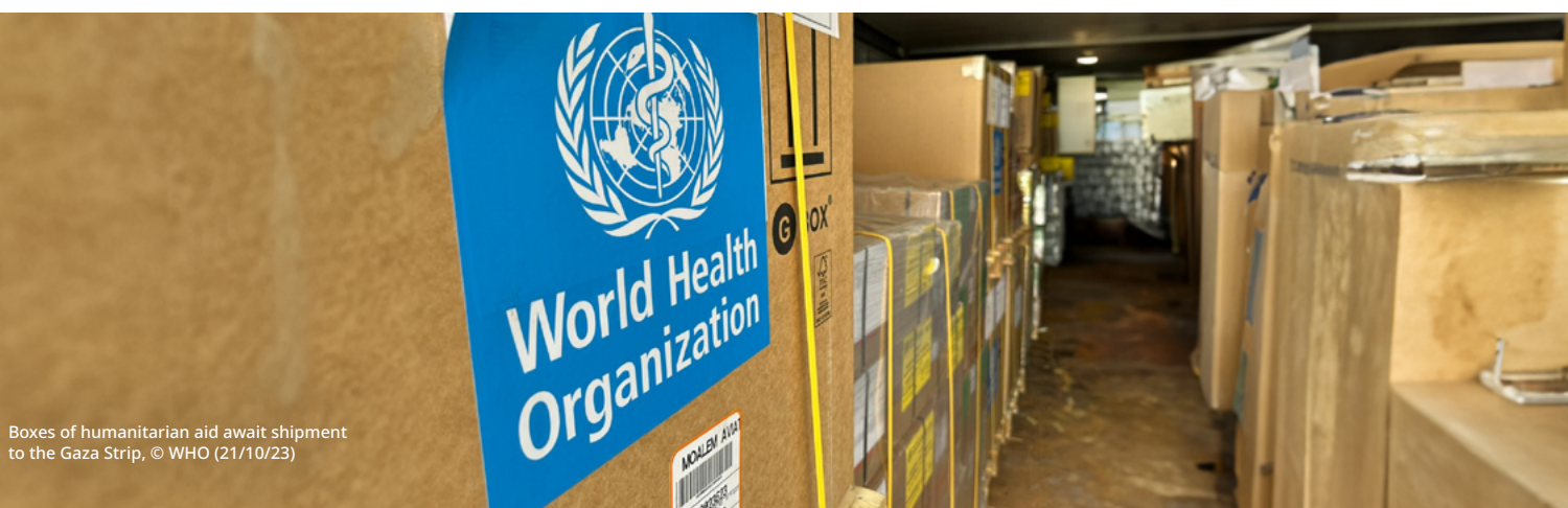
Boxes of humanitarian aid await shipment to the Gaza Strip