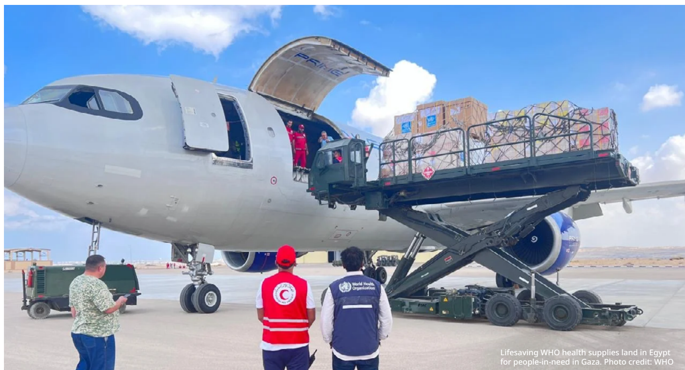
Lifesaving WHO health supplies land in Egypt for people-in-need in Gaza.