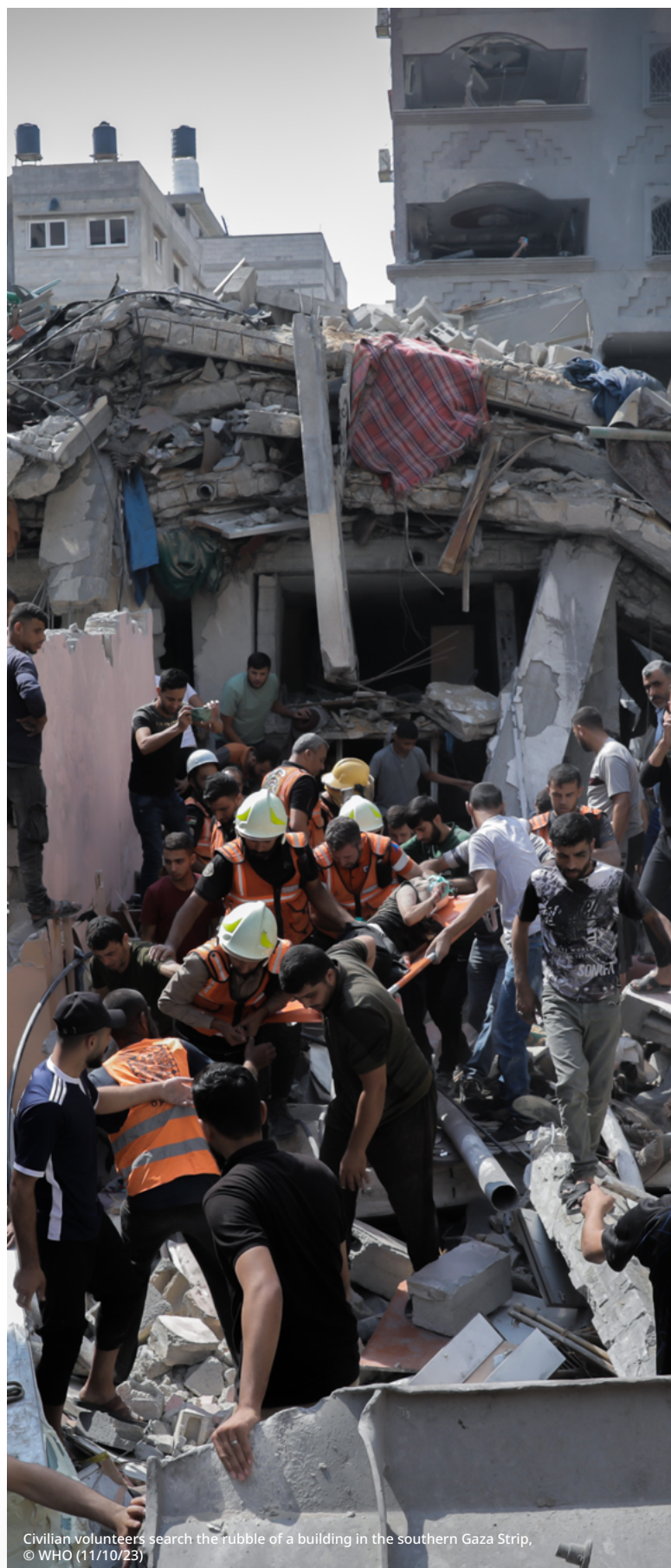
Civilian volunteers search the rubble of a building in the southern Gaza Strip, © WHO (11/10/23)

The escalation of hostilities in oPt and Israel carries the risk of direct or indirect consequences including violent protests, civilian casualties, injuries, damage to health facilities, and displacement in Jordan, the Islamic Republic of Iran and Iraq. The Jordanian government has confirmed that they cannot accept refugees, but such a contingency cannot be fully discounted.