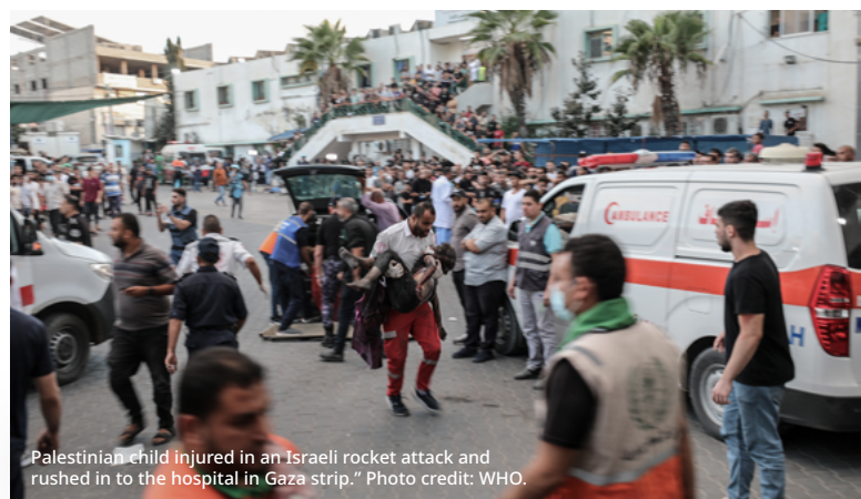
Palestinian child injured in an Israeli rocket attack and rushed in to the hospital in Gaza strip."

Since the escalation of the hostilities, the number of internally displaced people (IDPs) has reached over 1.4 million (>60% of Gaza's population), with 590 000 IDPs staying in UNRWA-designated emergency shelters (DES) in increasingly dire conditions. Fuel reserves in hospitals are critically low. 67% of primary care clinics and 35% of hospitals are non-functional. Essential medical equipment including life support machines are dependent on hospital electricity generators. UNRWA's DES are overcrowded, forcing many displaced people to sleep outdoors. There is an imminent risk of communicable disease outbreaks. Essential resources like water, food, and medicine are in critically short supply, leading to rising frustration and tensions among displaced populations. There are increasing risks of dehydration, hunger, water-borne diseases, and skin infections. There is also a risk of shutdown of electricity-dependent basic services, which would further aggravate the already dire situation.